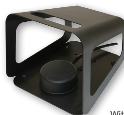
With 6202 Guard